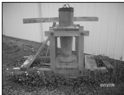
1. Splitter Sampler 2. Capstan 3. Horse Drawn Potato Lifter