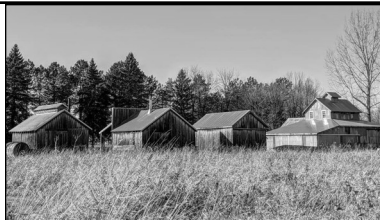
Back view of Sugar Shack, Blacksmith Shop, Cider Mill & Grain Elevator