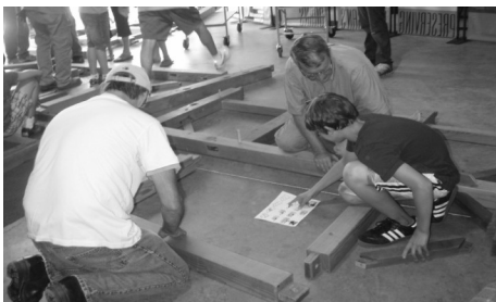
Photo below is from Teamwork and Timbers in 2011.

General Membership meetings will be held the second Tuesday every other month at 7 p.m. at the Octagon Barn Bank Building in Gagetown, Feb. April, Oct & Dec. with the August meeting in the Munro Building on Barn site. Please make note that the June General Membership meeting has been cancelled due to the Volunteer Picnic scheduled for June 10, 2018.