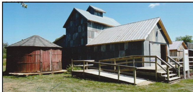
How the Grain Elevator Building has grown from the little building donated some years ago. Many are excited about all the activity and attention and will be ready to share the elevator stories of years gone by and remember simpler times.

Fall Family Days raises over 60% of our annual income and without it we could not accomplish what we have done to date.