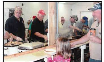
It's Breakfast time at Fall Family Days. When the Auten Family was unable to continue preparing the breakfast the Caro Knights of Columbus offered to take over several years ago. They do a fantastic job and all love the Farmer's Breakfast and the wonderful organization of the Knights. We thank the Auten family for their many