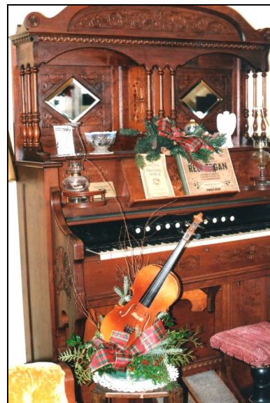
Katie's Florist , Sebawaing decorated the Parlor and beautifully used the existing pieces in the room and enhanced them with festive decorations.