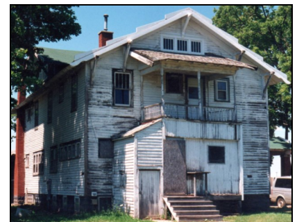
The Barn & House in 1993