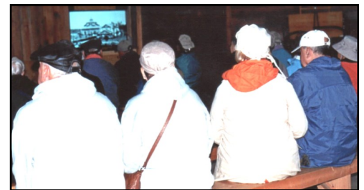
A group of visitors are seated in the Barn Theater viewing the video about the history of the Barn and its special features.