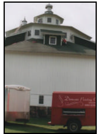
Painters from Duncan Painting are finishing off the windows on the dormers and cupola. Look closely and you will see them painting away. They look so small dwarfed by the immense size of this structure.