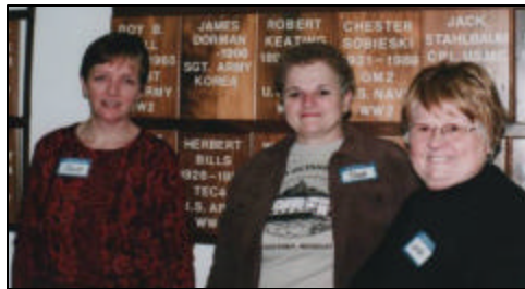
Below are photos from Annual Meeting, p. 1