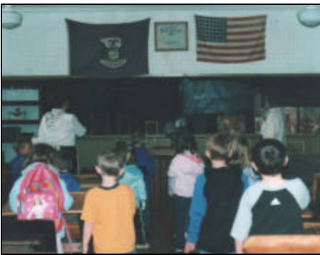
The One Room Country School provided a classroom where students were taught as they would have been years ago. Students are pictured saying the Pledge of Allegiance before their class began.