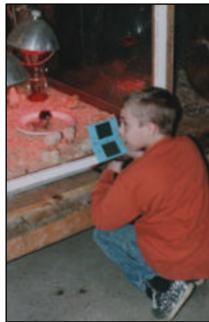
This little guy came prepared and was having a grand time taking pictures of the newly hatched chicks.